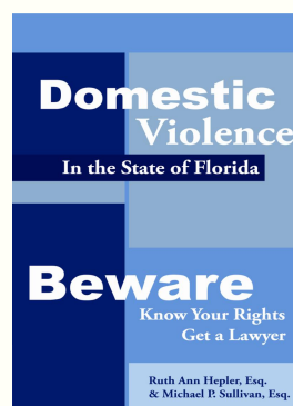
Domestic Violence In the State of Florida Beware: Know Your Rights Get a Lawyer