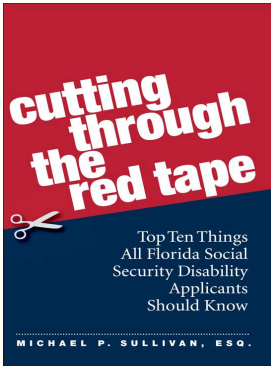
Cutting Through the Red Tape Top Ten Things All Florida Social Security Disability Applicants Should Know

You can call 904-384-8808 or go to www.sullivanandhepler.com to order any of our FREE books.